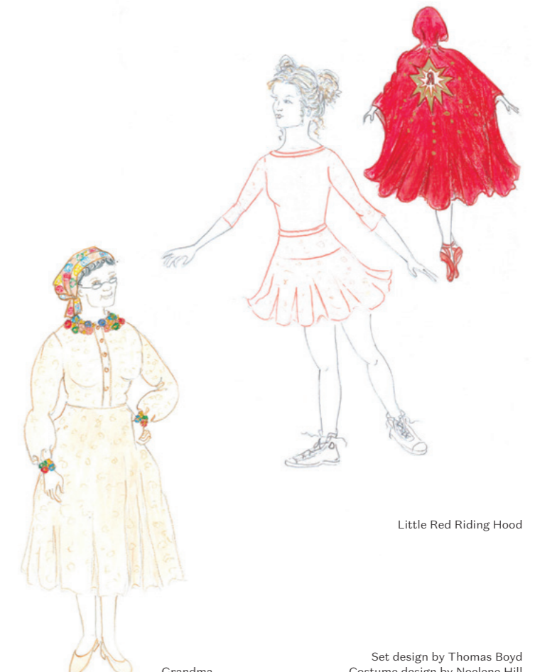
Little Red Riding Hood