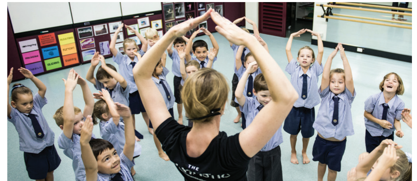
Sheldon College in-school workshop

Teachers should feel comfortable to move in and about the sections of the Resource Kit, considering richer and more inspiring experiential learning opportunities for a broader range of students and a greater variety of classroom situations.